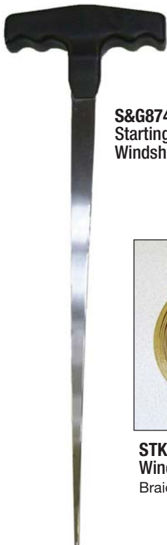
S&G87435 Starting Tool for Windshield Cut-Out Wire

S&G87440 , Handles for Windshield Cut-Out Wire (Set of 2).