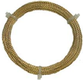
S&G87425 Braided, Golden, Windshield Cut-Out Wire