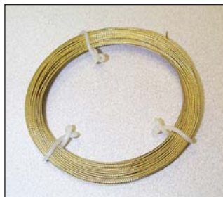
STK21410 Windshield Removal Music Wire Braided, gold 50 Feet