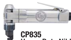
CP835 Heavy Duty Nibbler